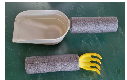
Built-up handles for functional use on vermicomposting tools.